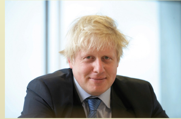
Boris Johnson the Prime Minister of the UK

Parliament has two parts: the House of Lords and the House of Commons. Members of the House of Commons are elected by the voters. They are known as Members of Parliament (MPs). The Prime Minister, or leader of the Government is also a MP. The Prime Minister is advised by a Cabinet.