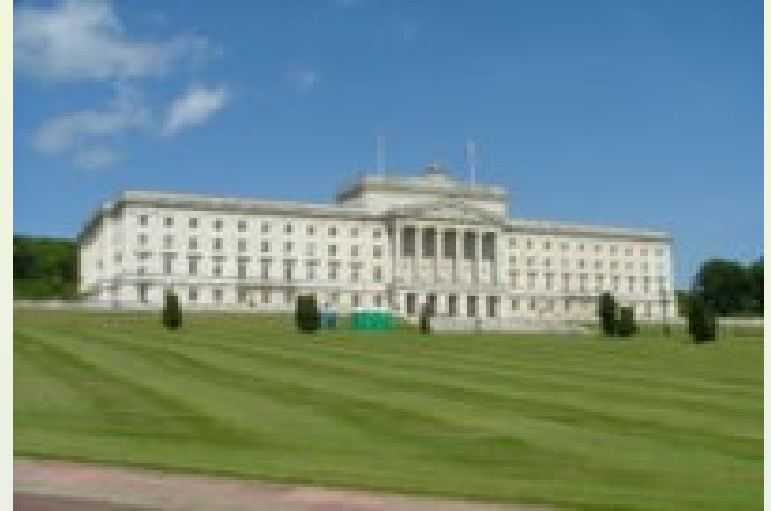
Parliament Buildings in Belfast

The Northern Ireland Office is led by the Secretary of State who sits in the Cabinet of the UK.