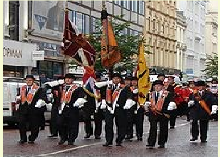
a holiday in Northern Ireland

Attractions include cultural festivals, musical and artistic traditions, pubs, welcoming hospitality and sports.