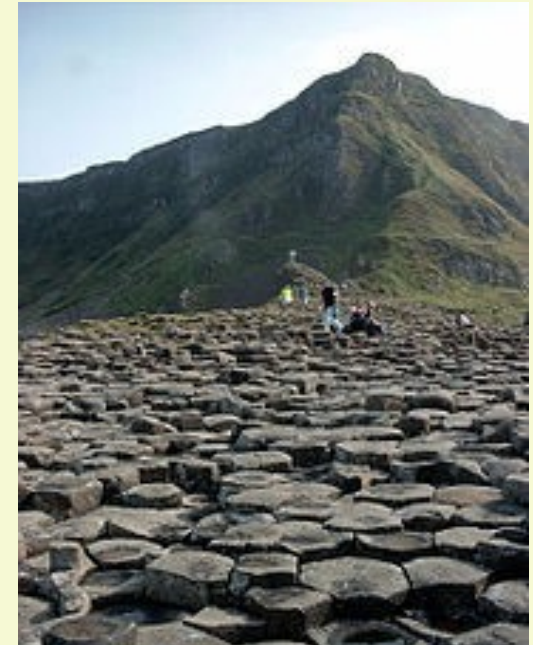
The Giant's Causeway, County Antrim