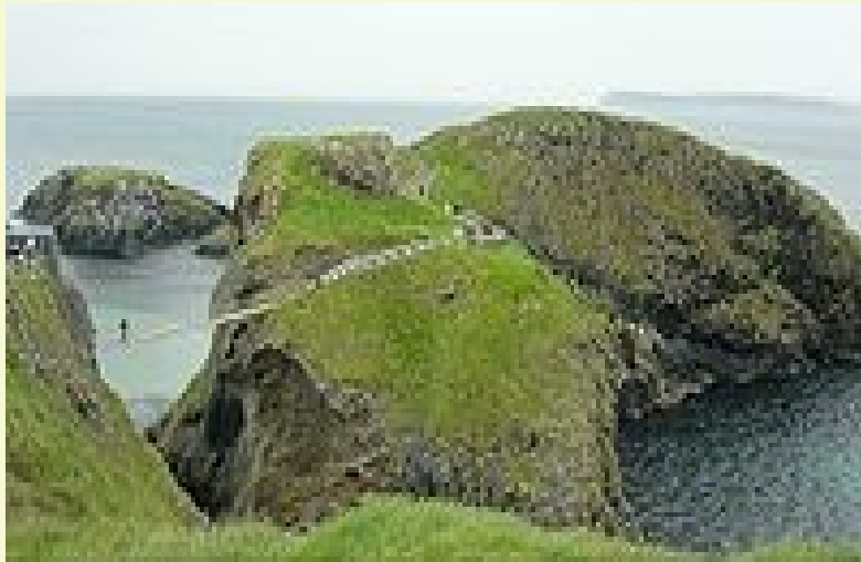
Carrick-a-Rede Rope Bridge